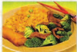
Beef with Broccoli

All Entrees Served with Fried Rice or Steamed Rice 1 Egg Roll and 1 Crab Cheese Wontom Mon - Sat: 11 AM - 3:00 PM