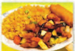
Kung Pao Chicken