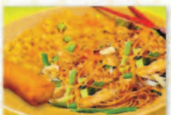
Chicken Lo Mein