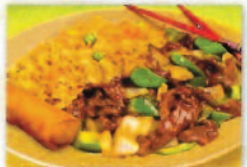
Beef with Green Peppers