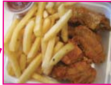
Wings & Fries