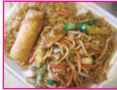
Chicken Lo Mein Combo