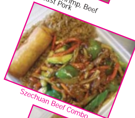
Szechuan Beef Combo