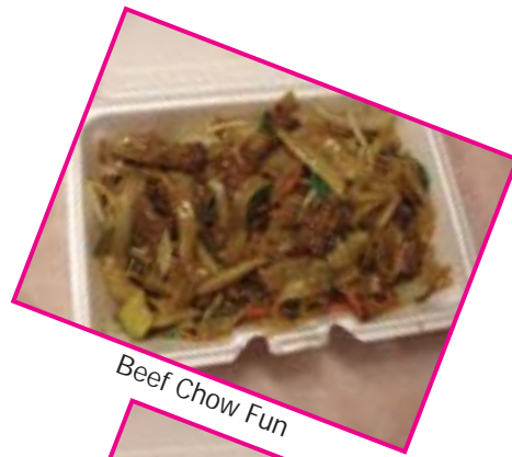
Beef Chow Fun