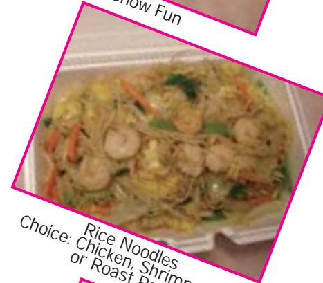
Choice: Rice Noodles Chicken, Shrimp, Beef or Roast Pork