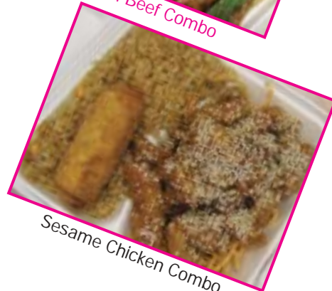
Sesame Chicken Combo