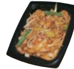
Chow Fun w/Veggies