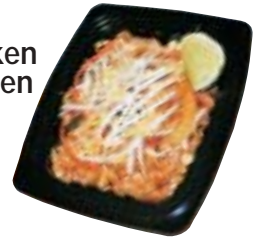
Pad Thai w/Veggies