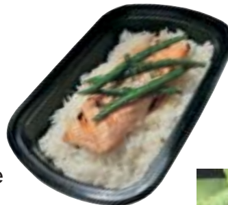
Grilled Salmon Plate

Chocolate Truffle Marquise, New York Cheese Cake