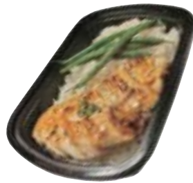
Grilled Chicken Plate