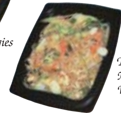
Thin Rice Noodles with Veggies