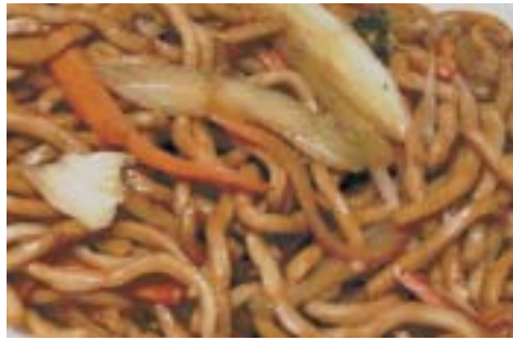
Side Lo Mein