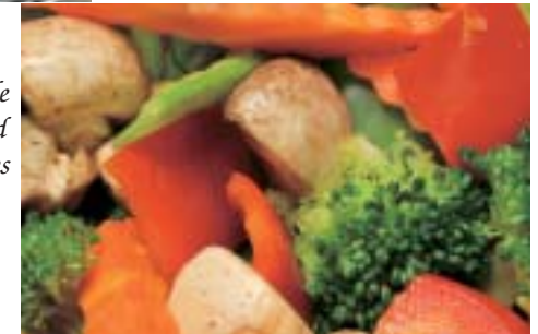
Side Mixed Veggies