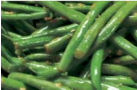
Side Green Bean