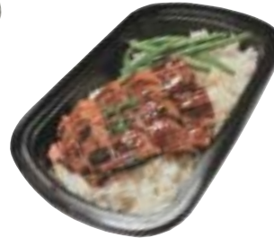
Grilled Steak Plate