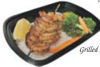
Grilled Shrimp Plate