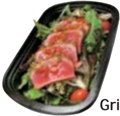
Tuna Tataki Salad